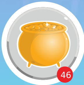
Pot of Gold