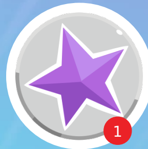
Star of the Week!