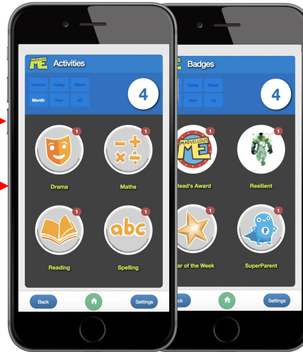
Parent App and MemoryBook